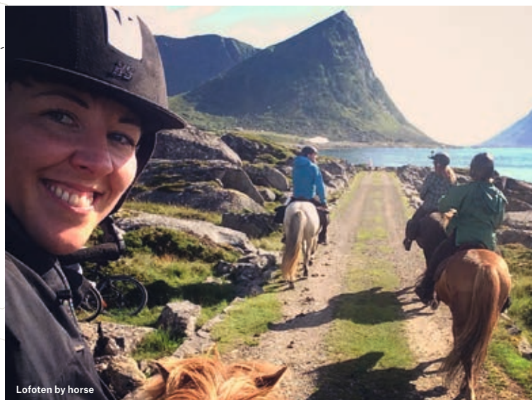
Lofoten by horse