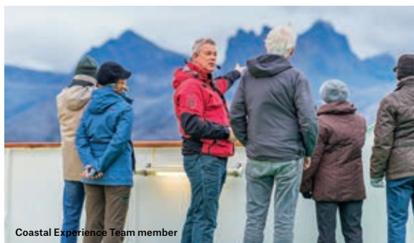
Coastal Experience Team member