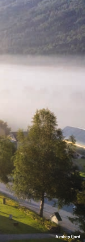
A misty fjord