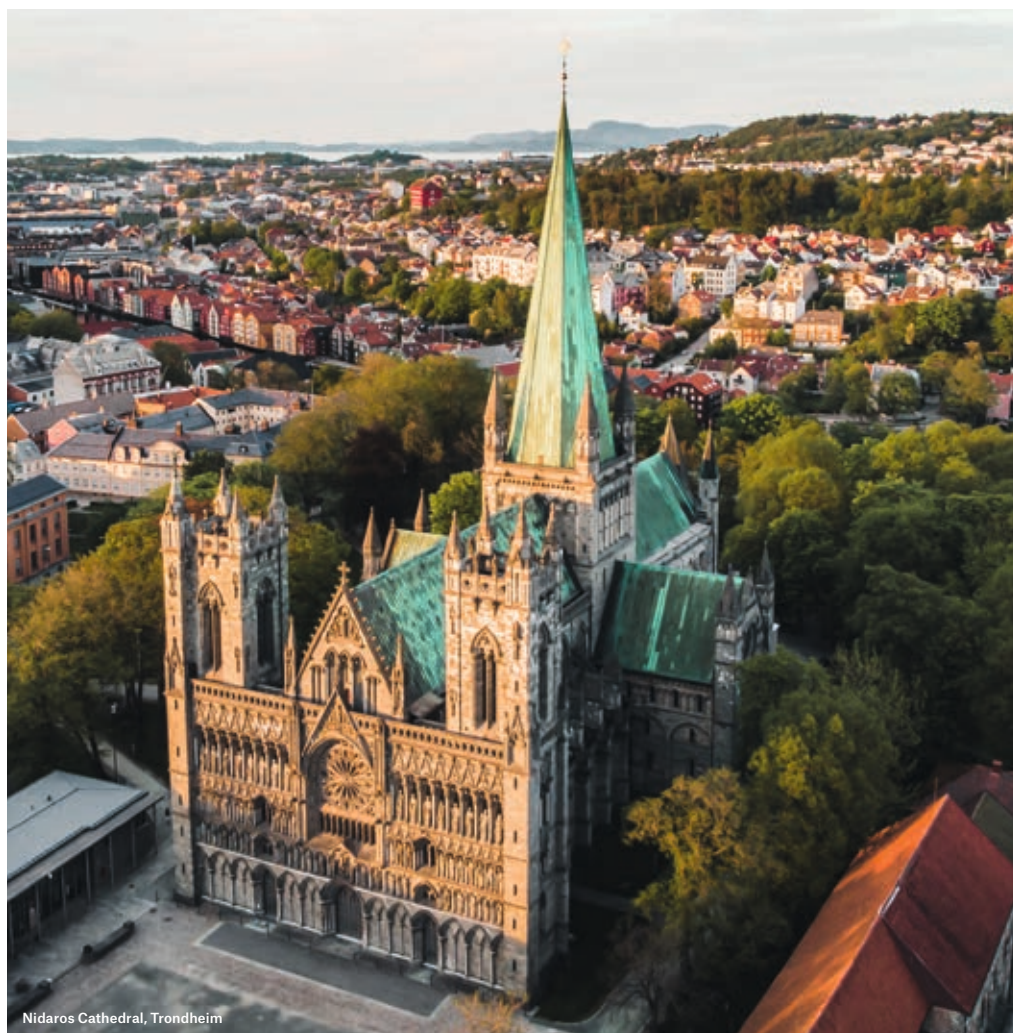
Nidaros Cathedral, Trondheim