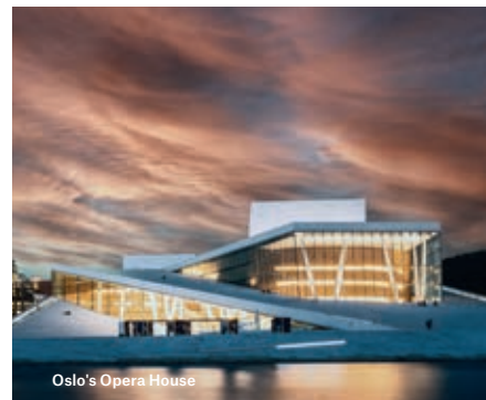
Oslo's Opera House