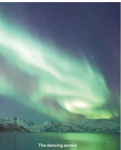
The dancing aurora

Days 14-15: Join a sightseeing coach ride of Oslo, including Holmenkollen ski jump and Vigeland Sculpture Park.