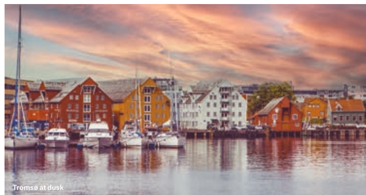
Tromsø at dusk