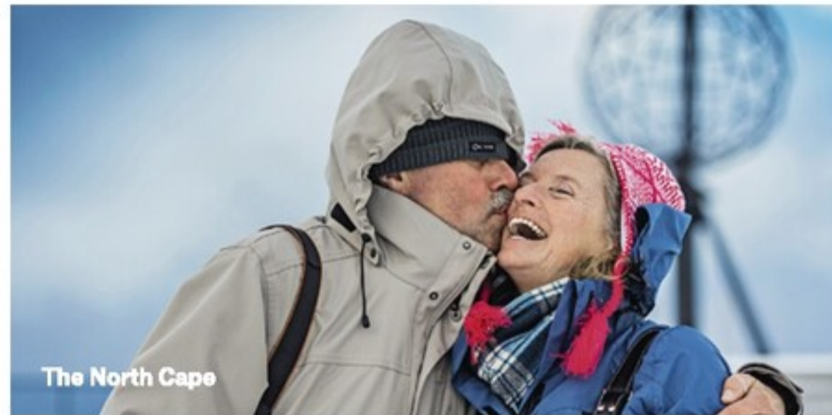
The North Cape

On the water The striking red color of these houses on stilts stands out in the snowy Lofoten Islands.